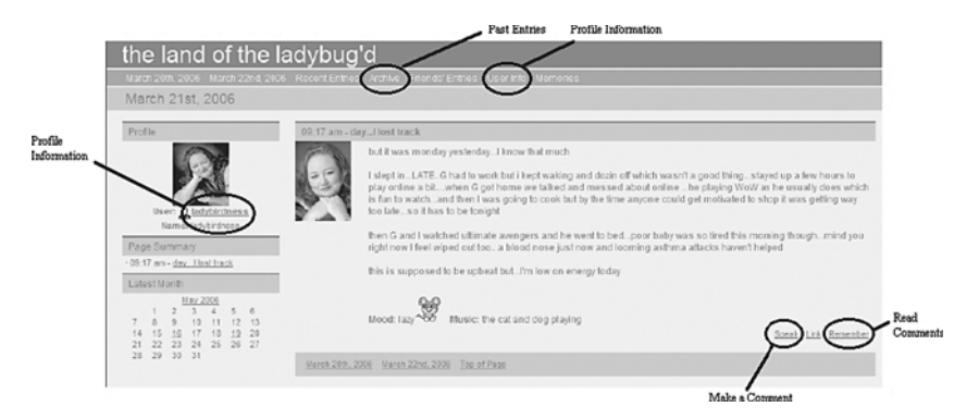
Figure 1. Visual layout of a typical LiveJournal blog

'reading' blogs – the content of blog pages. It is almost like one needs to learn not only how to read blogs but also how to view them.